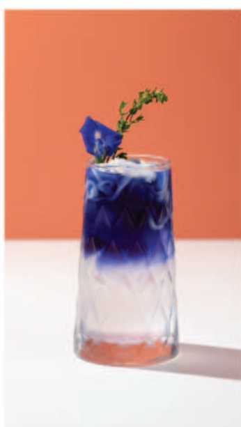
COCONUT BUTTERFLY PEA