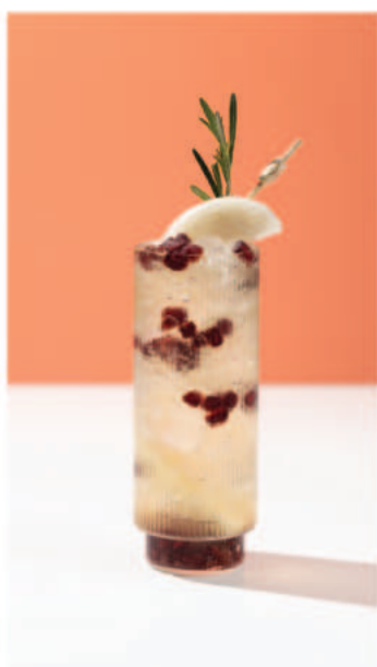
GREEN TEA WHITE PEACH